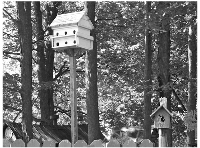
14. Big house, little house, this birdhouse entrance is in the shape of Michigan! Where will you find it? (name the intersection)