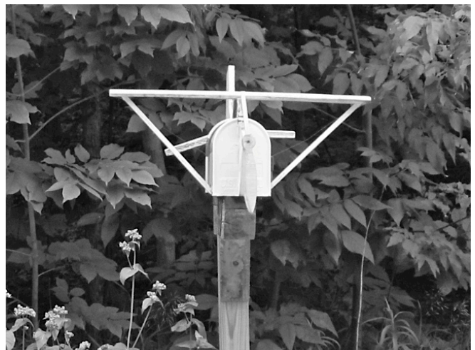
6. Landing at what address?