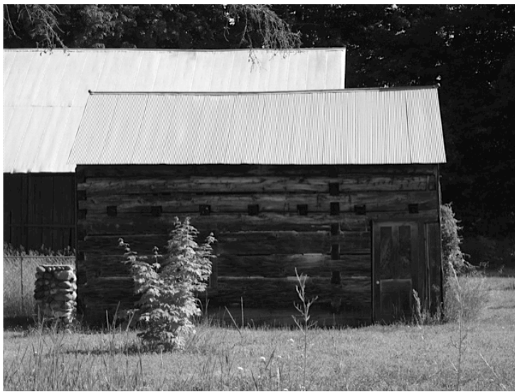
21. How many stone pillars will you find here?