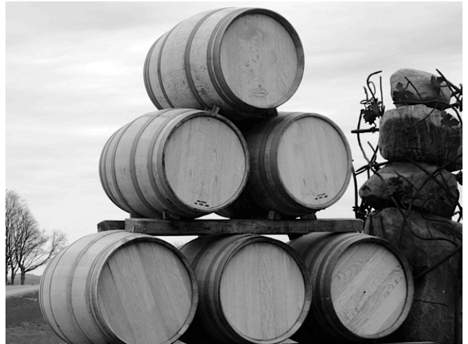
2. Whose barrels are these?