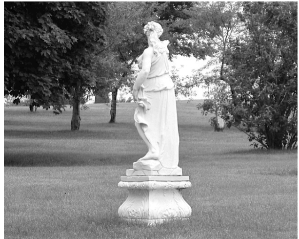
10. How many white ladies do you see?