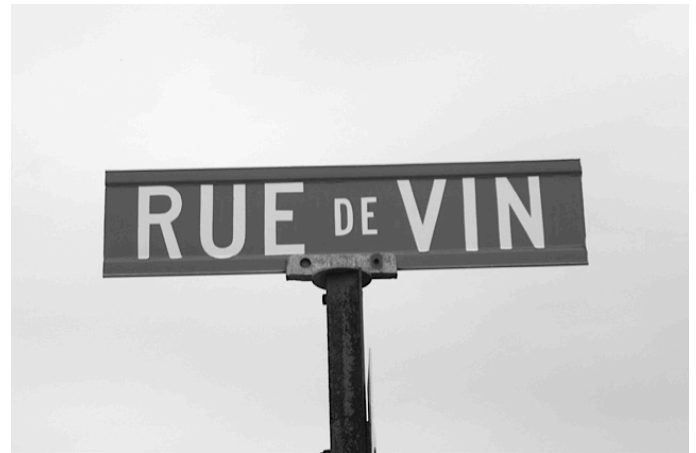
20. Legend has it the casks broke and the road ran red with wine.... Where does this road lead?