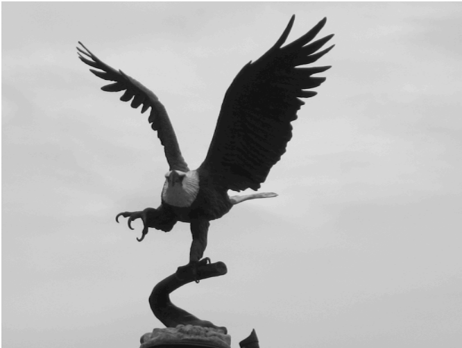
1. Found near _____ Drive.