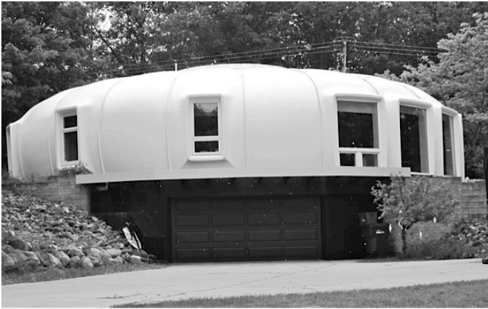
7. Where will you find this unique house? (address)