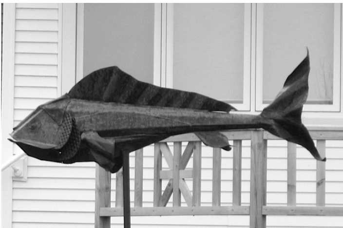
11. Address please?