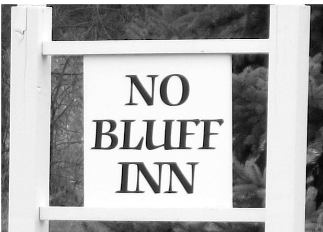
17. When can you stay here?