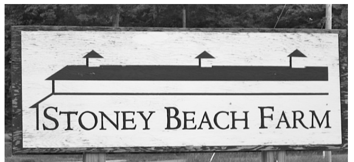
18. What can you buy at this farm?