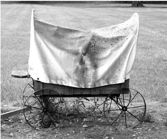
9. Established in _____?