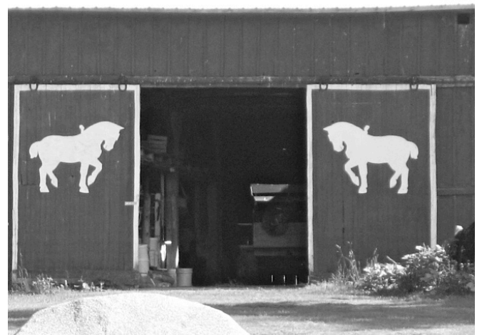
24. What are the other two horses doing?