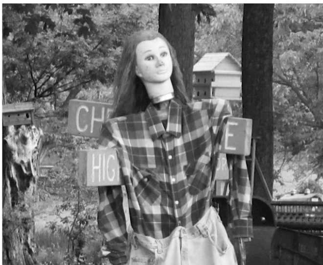
23. Strange but true. Where is s/he located?