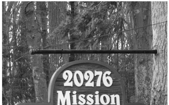
4. Mission _____?