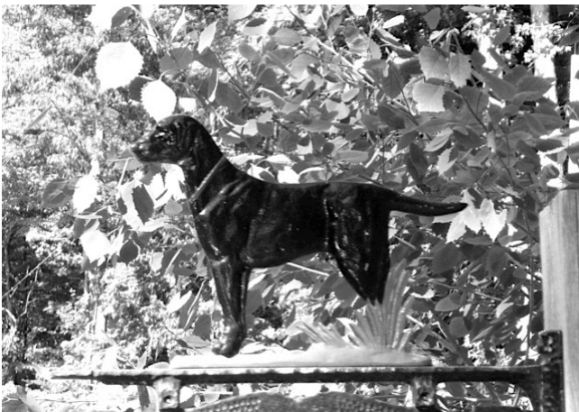
3. What is this dog's address?