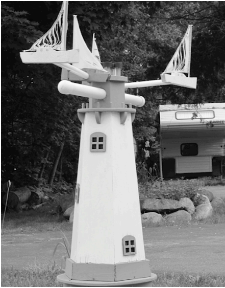
13. Who hangs out watching over this strange lighthouse?