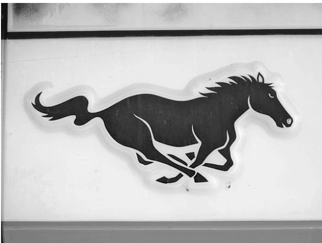
5. The sign says?