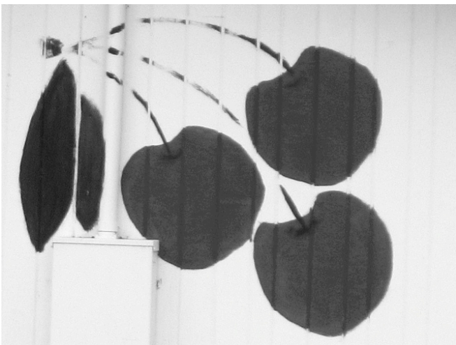
15. Located where?