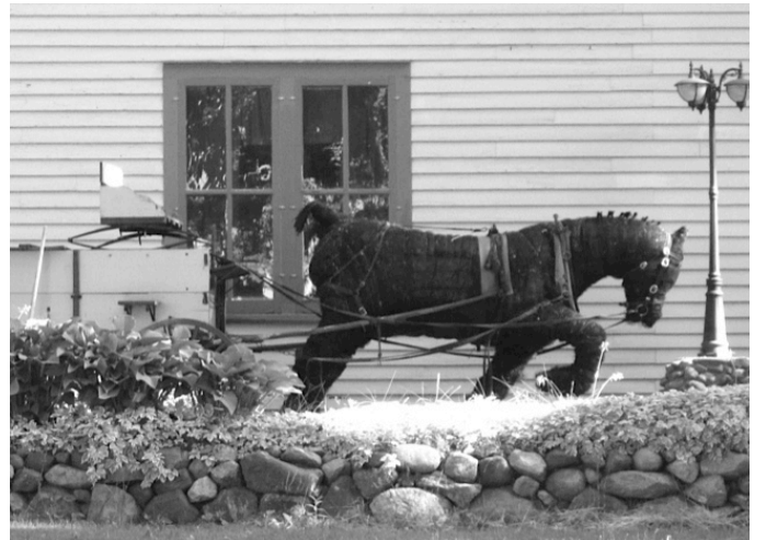
16. "F____, F_____ and F_____" Complete this phrase.