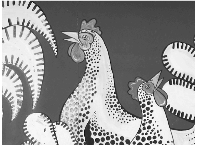
8. "Drop a _____" Complete the phrase.